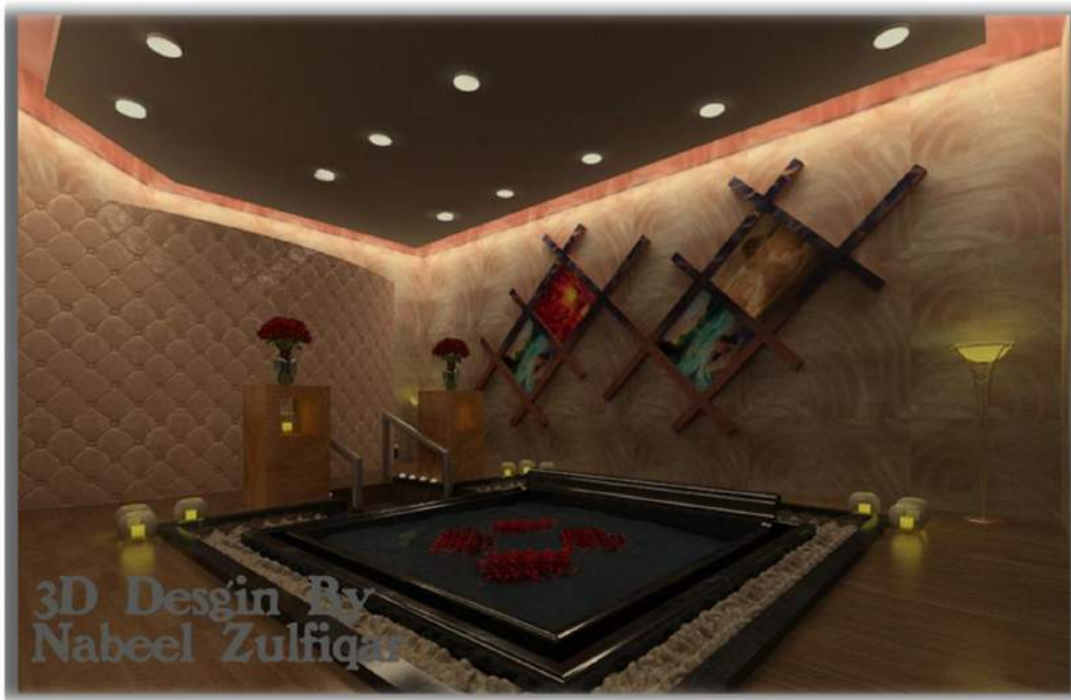
SPA ISLAMABAD (INTERIOR)