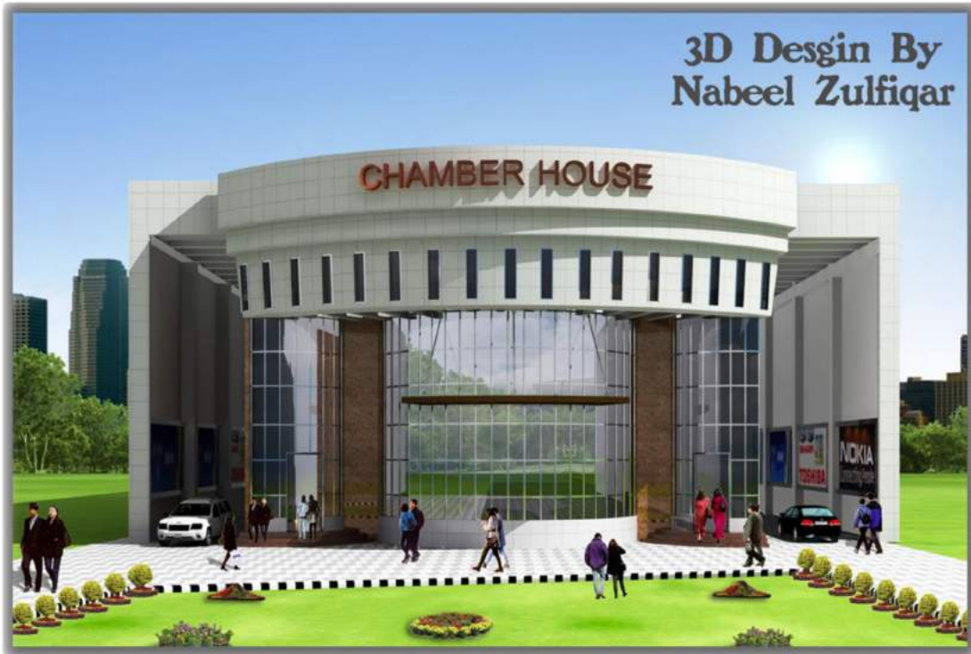
CHAMBER OF COMMERCERAWALPINDI