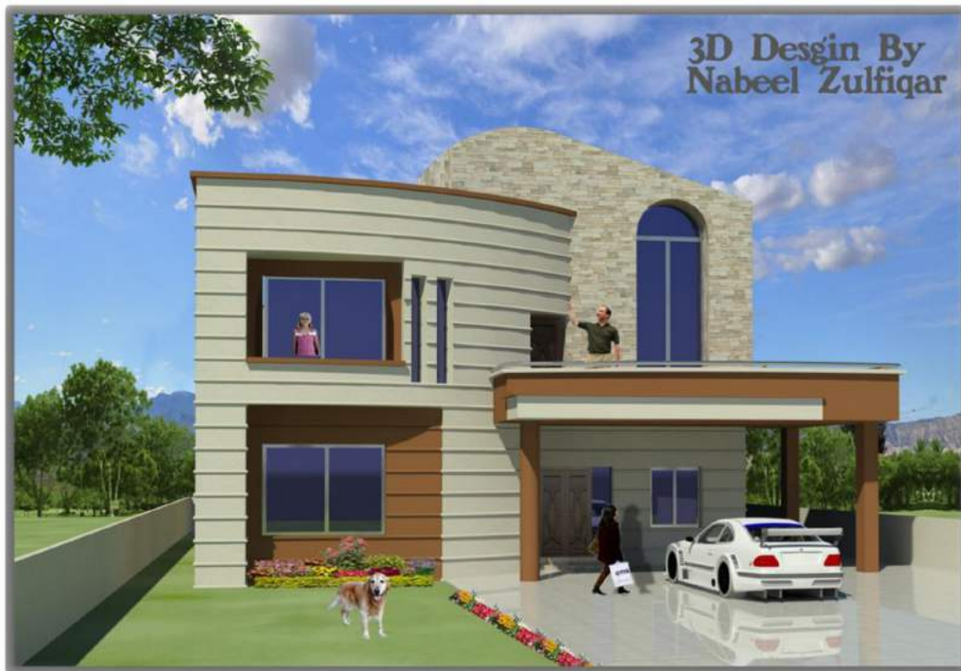
SALEEM SB ISLAMABAD