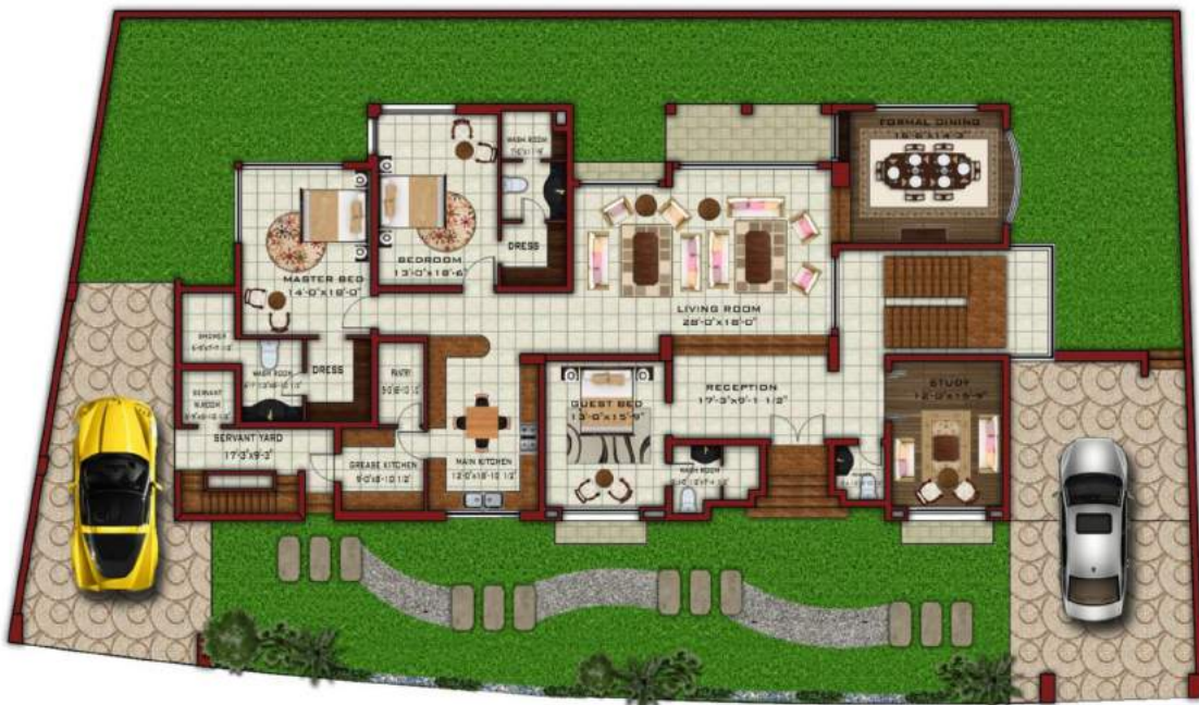
GROUND FLOOR PLAN COVERED AREA 3511 SFT