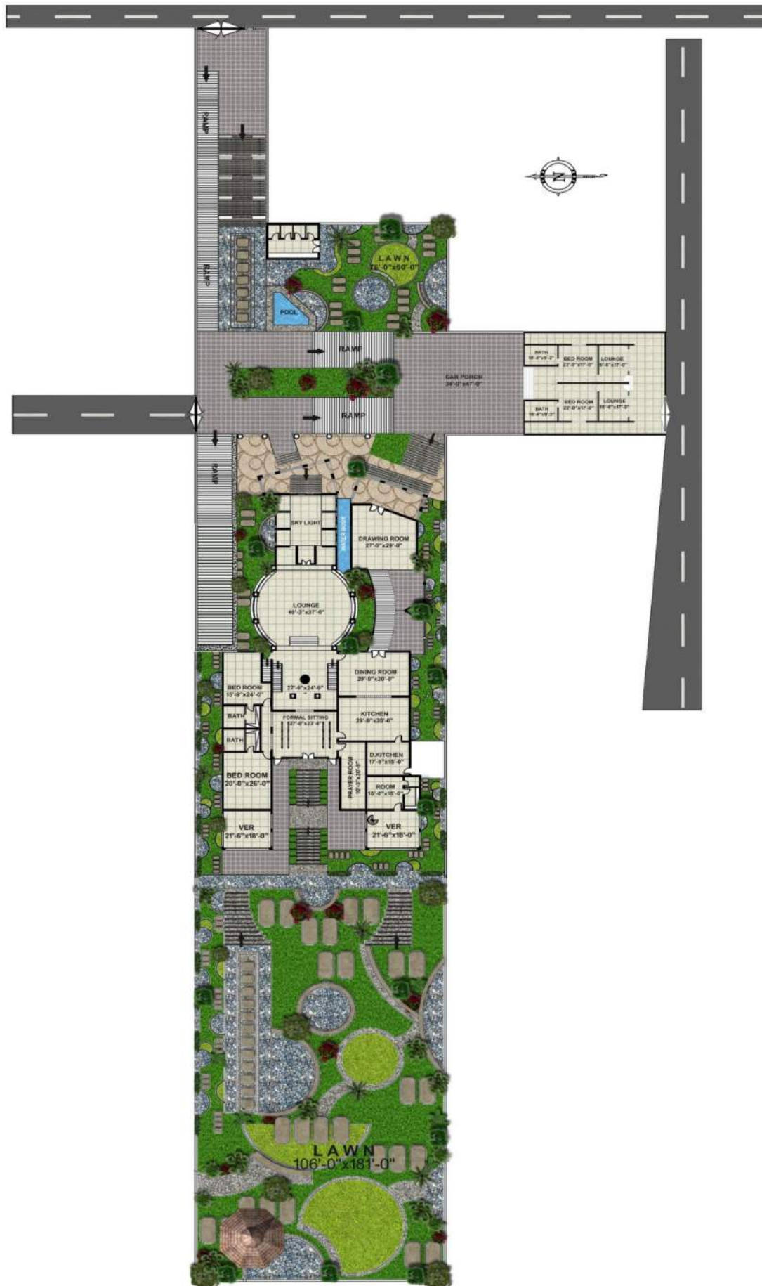
SHARAFAT FARM HOUSE (SANGJANI)