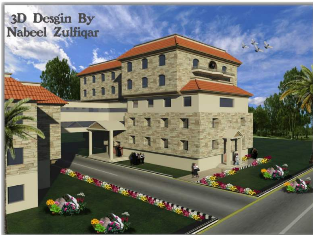
FATIMA JINNAH WOMEN UNIVERSITY HOSTEL RAWALPINDI