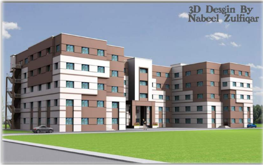
PAK TURK SCHOOL H/8 ISLAMABAD