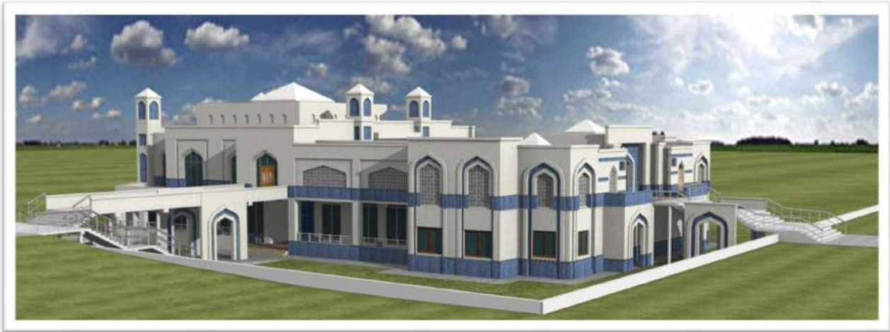
MOSQUE ASKRI 14