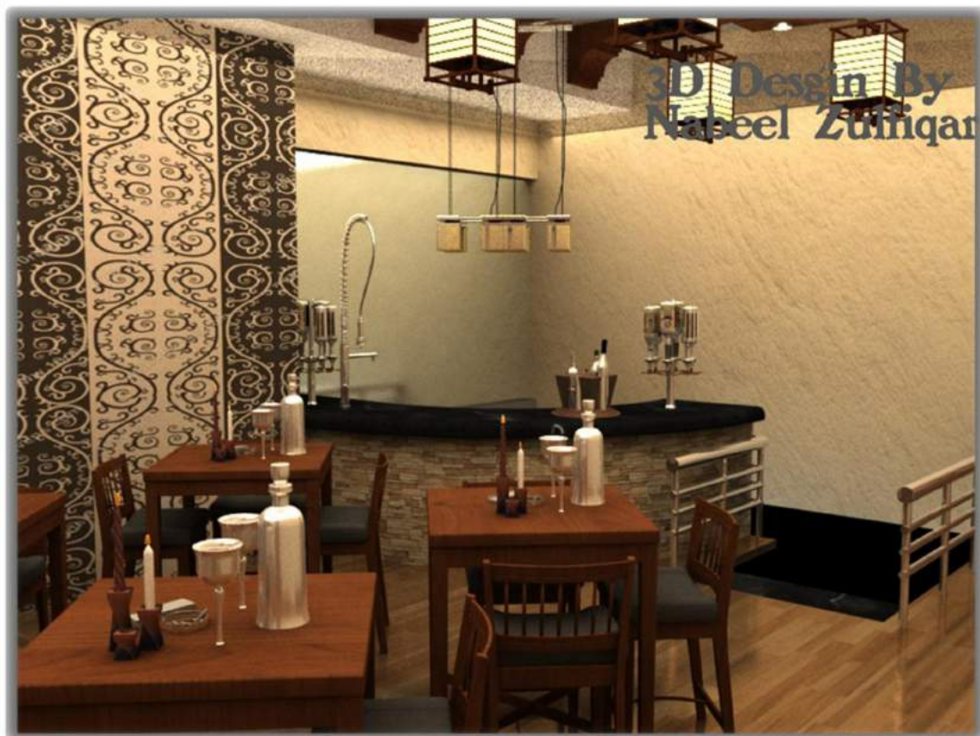
BAR ISLAMABAD (INTERIOR)