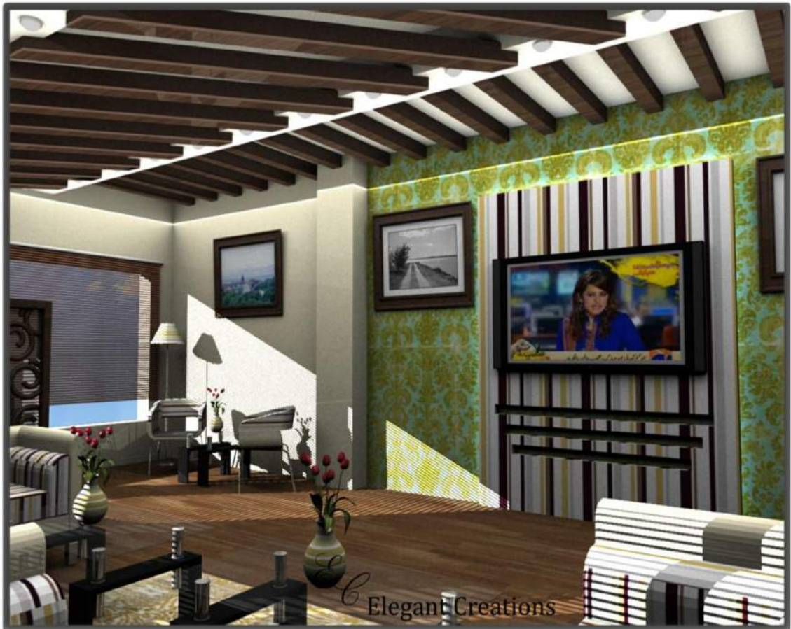
AWAN PROPERTIES BAHRIA (INTERIOR)